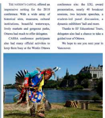
Conference host city Ottawa offered CASSA delegates a wealth of off-site sightseeing opportunities, including the Parliament buildings, museums, historic waterways and Indigenous cultural experiences.