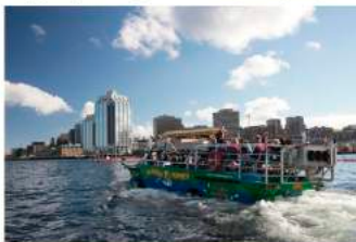
The Harbour Hopper cruises through the Halifax Harbour offering passengers a great view of the city's downtown, waterfront, bridges, ships and harbour traffic.

THE WEATHER WAS gorgeous (not always a guarantee in a northern port city, even in July) and the people were friendly in Halifax, the site of the 2017 CASSA conference. In addition to engaging sessions, delegates enjoyed a tour of the Canadian Museum of Immigration at Pier 21. For many, this is where their family's journey in Canada began. Some delegates took part in a trip to Peggy's Cove and a tour through the city's streets and harbour in the Harbour Hopper amphibious vehicle. This year's gathering saw over 200 delegates in attendance at the Westin Nova Scotia. We also had over 20 sponsors and exhibitors on hand to connect with delegates. We hope to see you next year.