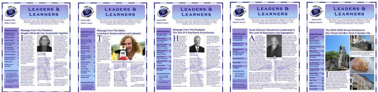
The first five years: Issue 1 (December 2004), Issue 5 (Summer 2005), Issue 8 (January 2006), Issue 16 (February 2007), Issue 34 (Summer 2010).

CASSA members and other education professionals from across North America helped contribute to features covering topics such as off-campus schools, Indigenous education and achievement, rural and urban school boards, women in leadership, mentorship, STEM and STEAM education, early childhood development, living school initiatives, Black History Month, effective